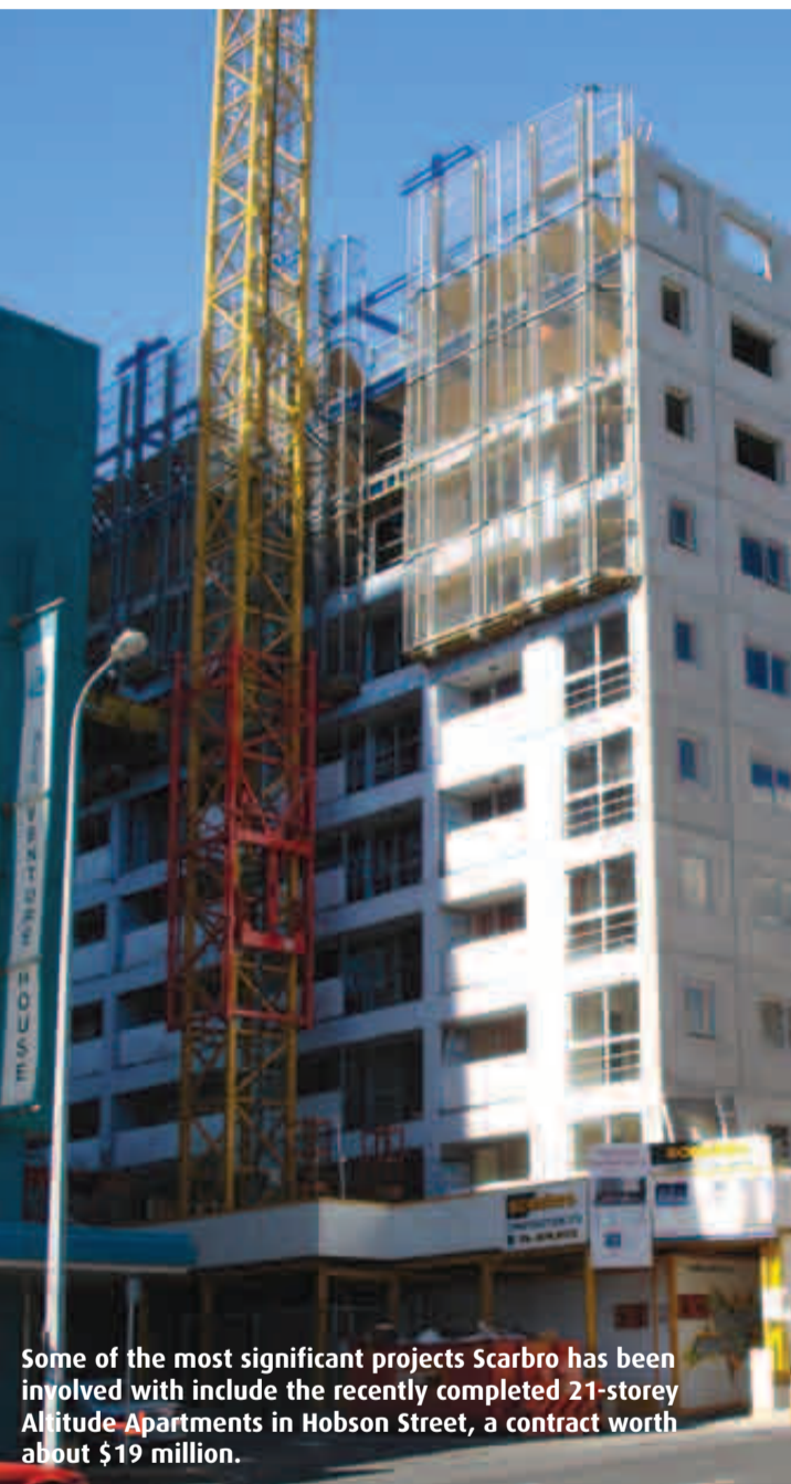
Some of the most significant projects Scarbro has been involved with include the recently completed 21-storey Altitude Apartments in Hobson Street, a contract worth about $19 million.